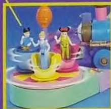
The train activates the Tea Cups... watch them spin!

Visit Disney's website at www.disney.com