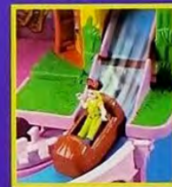
Whoosh! Make the log go down Splash Mountain!*