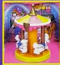
Spin King Arthur Carrousel! Just turn the turret!