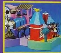
When the train pulls into the station, Mickey waves, the bird spins, and the clock turns!