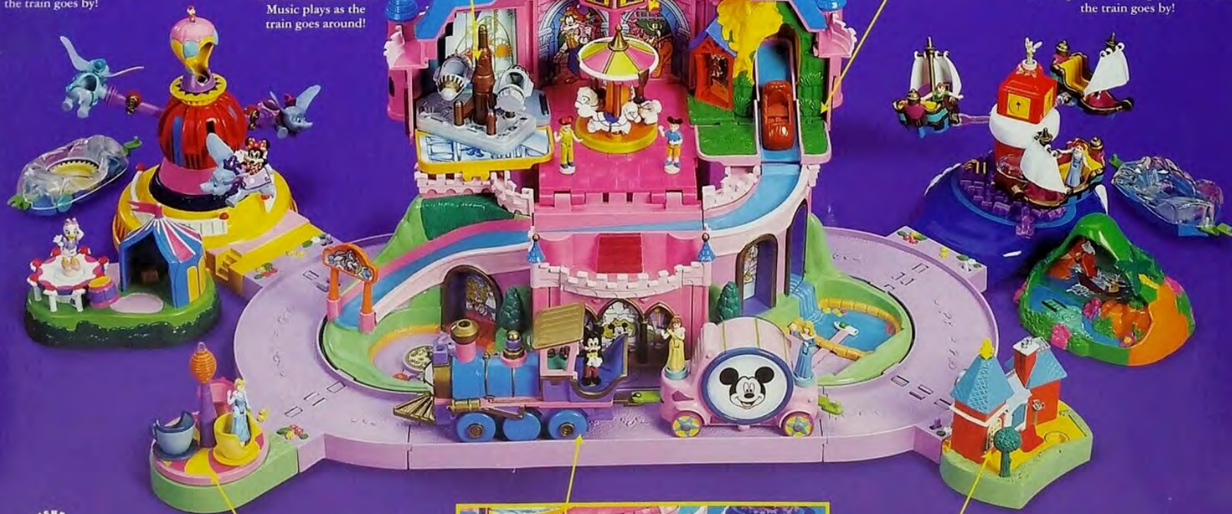
Add Peter Pan's Flight Playset (sold separately and subject to availability). The ships "sail" through the air when the train goes by!