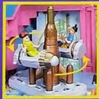
Up they go in the Tomorrowland Rocket Ride!