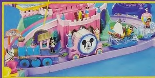
Train stops at each turn and makes the attractions move! Add Dumbo and Peter Pan floats behind the train and lead a grand parade!