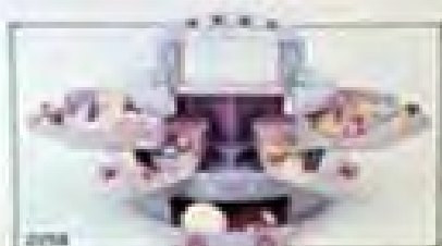
Pull-out Playhouse Two stories of pull-out fun for Polly and her friends! Secret compartment too!