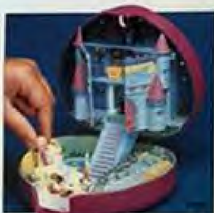
Starlight Castle™ Playset An enchanting fairy tale castle for Polly and Prince Casper that lights up when you open it! Available Spring 1993