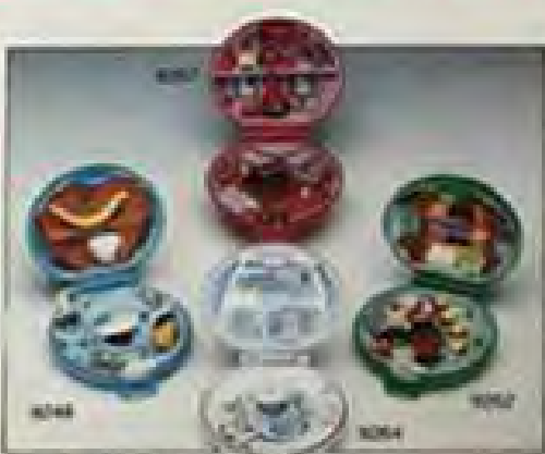
The Jewel Collection 6201 Princess Polly's Under the Sea Kingdom Playset 6202 Princess Polly's Woodland Kingdom Playset 6203 Princess Polly's Ice Kingdom Playset 6204 Princess Polly's Eastern Kingdom Playset A beautiful collection of sparkling jeweled playsets you can take anywhere! Available May 1993.