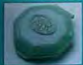
Polly's compact closes up neatly and tightly!