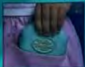
Take Polly everywhere for playtime fun!