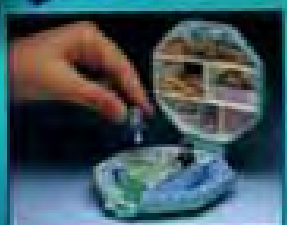
Bring your friends to play in Polly's School!